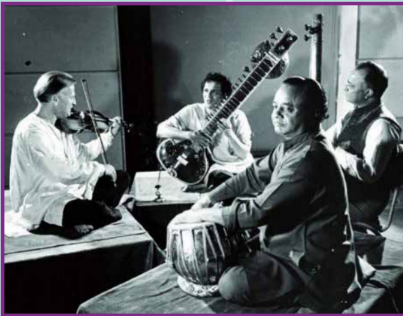
Ravi Shankar, Yehudi Menuhin and Alla Rakha